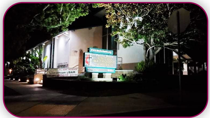
Labor of Love: New Lighting on Ingraham Street Side of Sanctuary.