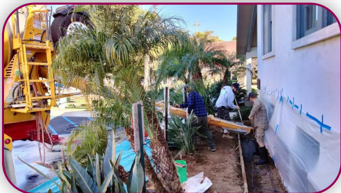
Labor of Love: Pouring the Cement Foundation for the New Screen in Front of the Admin. Building.