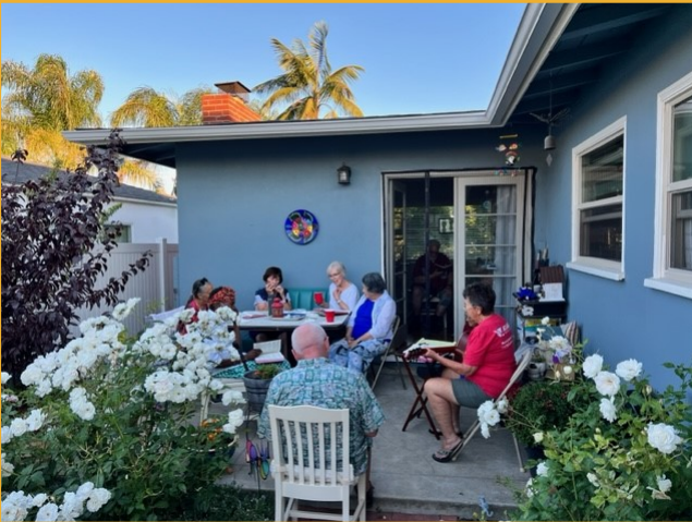
Summer 2023 Hymn Sing and Potluck