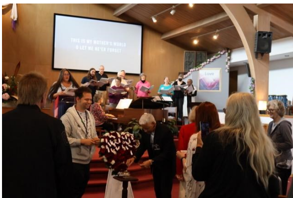
Worshippers share names of their mother figures during Mother's Day service.