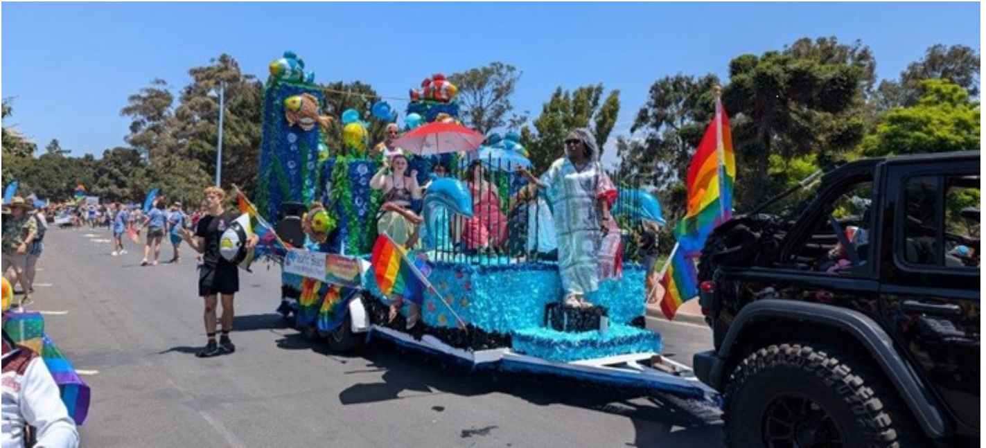
Above: The PB UMC float in last month's Pride parade